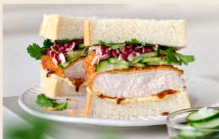
09 | CHICKEN KATSU SANDO