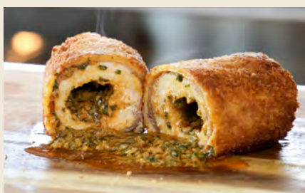
17 | CAFÉ DE PARIS STUFFED SCHNITZEL