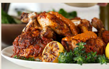
23 | SMOKER BBQ PERI PERI CHICKEN