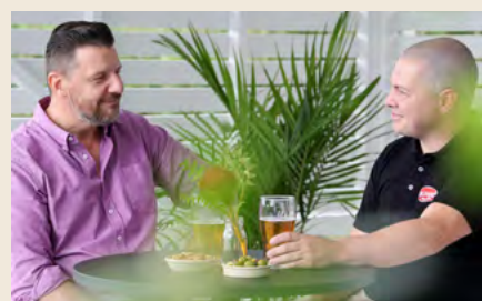
16 | IT'S ABOUT FEEDING AUSTRALIA