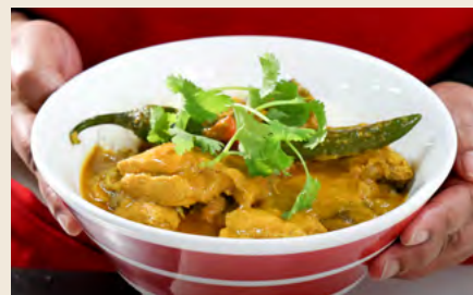
11 | MEENA'S SRI LANKAN CHICKEN CURRY