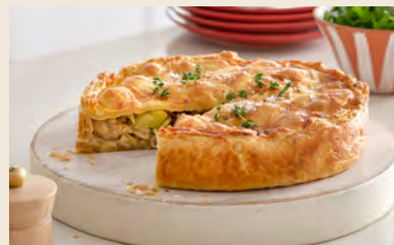
07 | FAMILY CHICKEN AND LEEK PIE