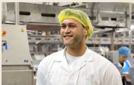
10 | COMMUNITY AT INGHAMS