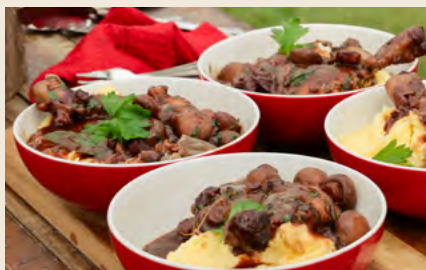
05 | COQ AU VIN