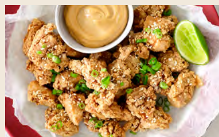
21 | VEGEMITE CHICKEN BITES