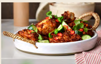
13 | MALAYSIAN FRIED CHICKEN AND RICE