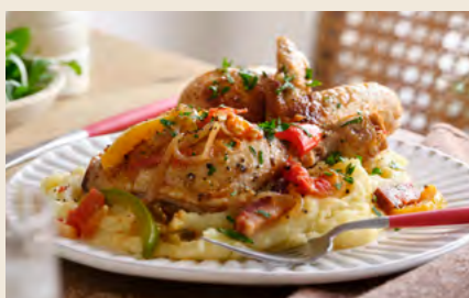
19 | CHICKEN BASQUAISE